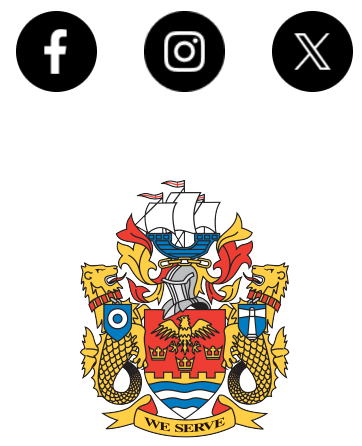
North Tyneside Council

In total, six residents received job offers with ProCon. The team are already discussing a second cohort as capacity within the business expands.