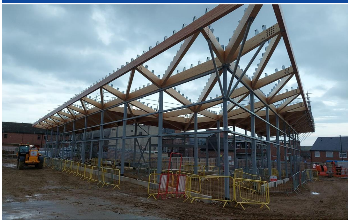
The steelwork structure is well underway now and is visible above site hoardings. Works to the roof have begun.