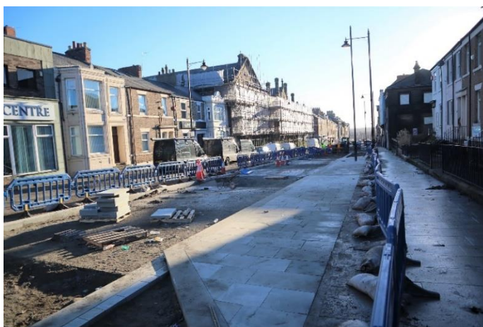
Above: (Top left) Upper Camden Street; (Top right) Between Church Way and Bedford Street; (Bottom left) Northumberland Place; (Bottom right) Howard Street.