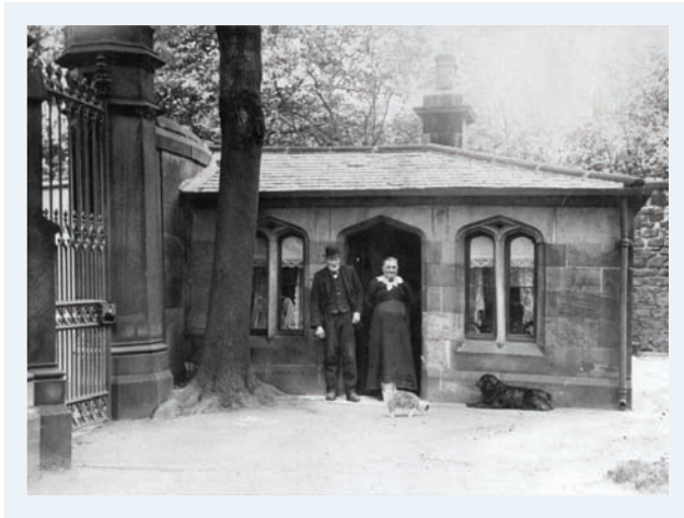
Tynemouth General Cemetery Lodge

Burials: 1833 – 1939 Monumental Inscriptions