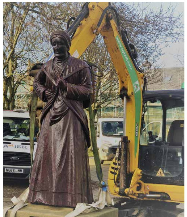
The much-loved Wooden Dolly statue being taken away for restoration