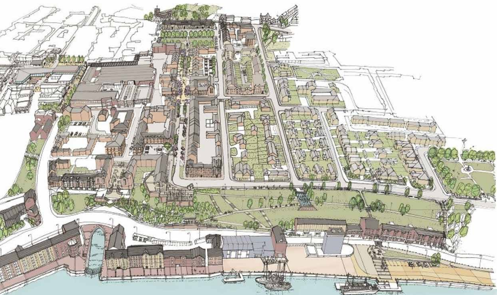
Artist's impression of the High Street Heritage Action Zone area

For more information please contact Robin Fry at VODA on robin.fry@voda.org.uk