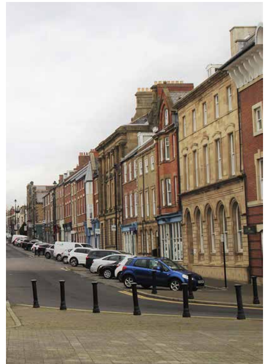
Historic buildings on Howard Street