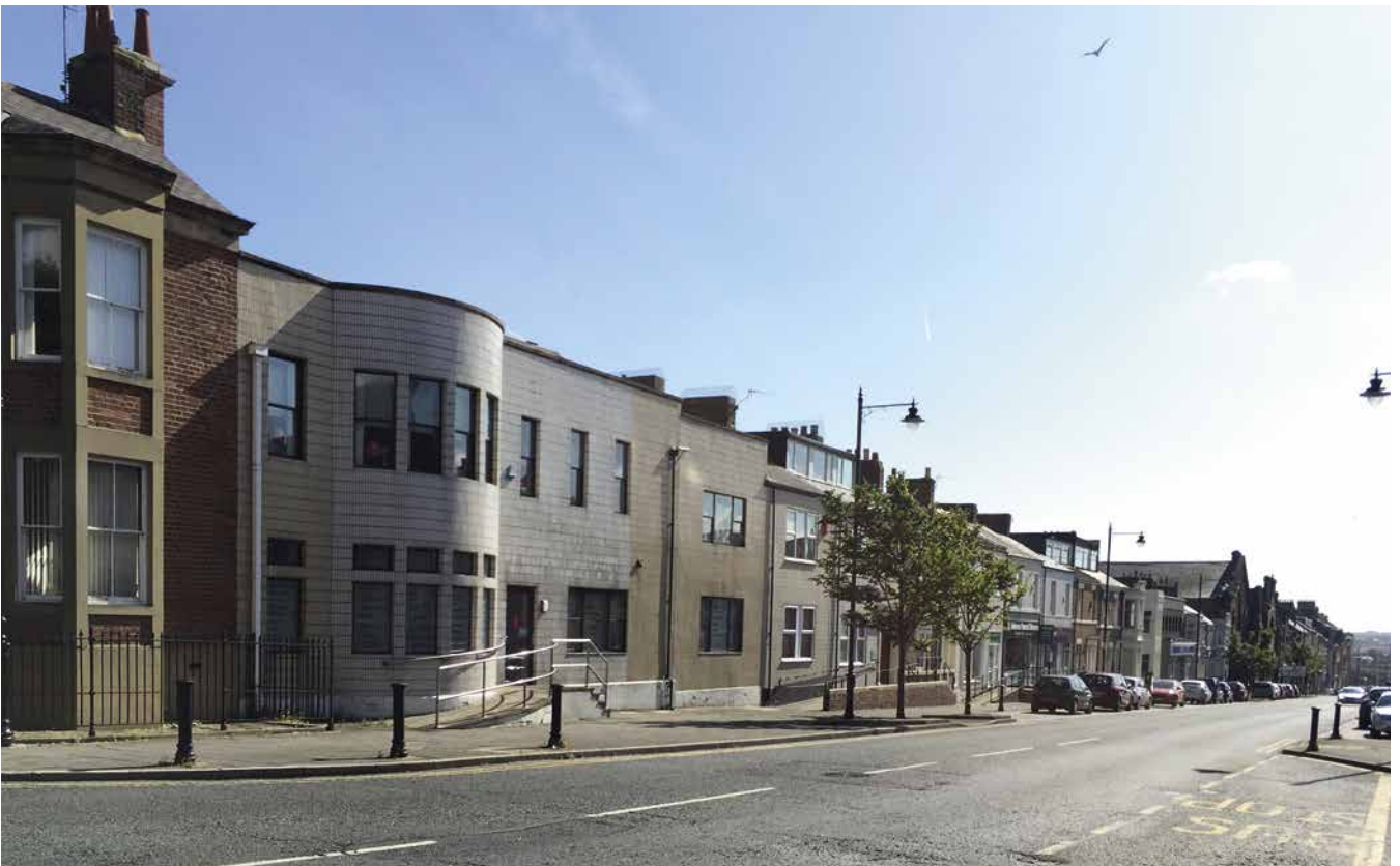
A view of Howard Street

We're delighted that North Tyneside Council was successful in applying for some of this money for North Shields – in particular, the Northumberland Square and Howard Street area, historically designed to be the grand centrepiece of the town laid out on the banksides above the river that