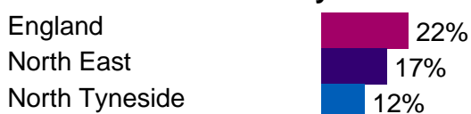
Chart 1. Proportion of workers on zero hours contracts by area

Less than a quarter (12%) of the workforce in North Tyneside were on zero-hours contracts. Over half (58%) of the workforce usually worked full-time hours and 42% were part-time.